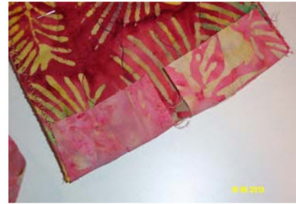
EXTEND ABOUT 1 INCH AND FOLD UP

OPEN OUT THE STRAP AND PIN TO ONE SIDE EDGE OF THE BAG RIGHT SIDES TOGETHER; EXTEND THE STRAP ABOUT 1" BEYOND THE BOTTOM THEN FOLD UP OVER THE BOTTOM AND PIN. MAKING SURE YOU DO NOT TWIST THE STRAP PIN THE OTHER END OF THE STRAP THE SAME WAY ON THE OPPOSITE SIDE OF THE BAG. STITCH TO THE BAG USING A 1/2 SEAM ALLOWANCE . ( PUSH MEASURING TAPE OUT OF THE WAY ) FOLD THE STRAP OVER TO THE OTHER SIDE OF THE SACK AND SEW DOWN CLOSE TO THE FOLD, CONTINUING SEWING ALONG THE ENTIRE LENGTH OF THE STRAP TO THE OTHER SIDE OF THE SACK. YOU MAY STITCH THE FOLDED SIDE ALSO IF YOU LIKE.