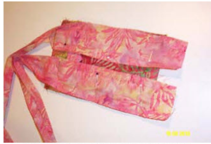
OPEN OUT AND PIN TO SACK.DO NOT