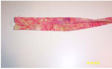
FOLD AND PRESS STRAP